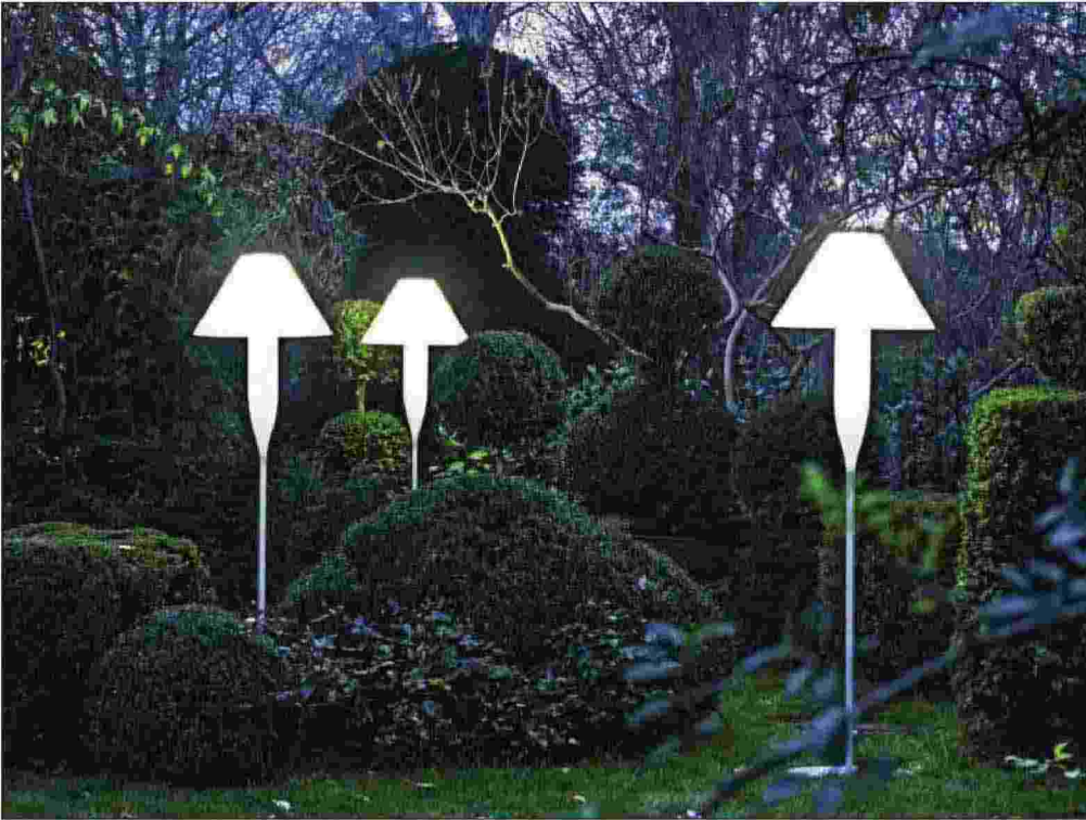
Sleek indoor/outdoor floor lamps provide creative illumination for landscaping, or they can be positioned to guide visitors along a garden path.